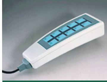
Pre-fitted Cable Glands