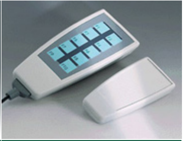
Top Recess for Keypads